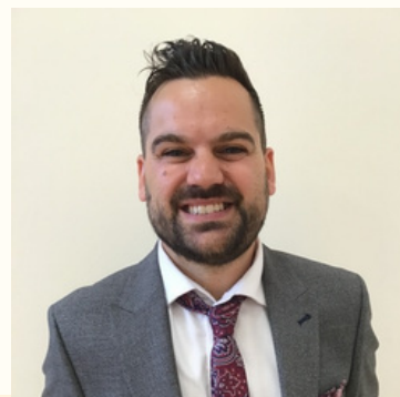
Head of School/ Owls Class teacher

I also lead Science, Computing, Design Technology, Religious Education and work closely with the ethos committee and Eco-council. In this role I monitor teaching and learning and raise the profile of these subjects within school. I love using these platforms to create everlasting memories/experiences for children, giving them new opportunities and igniting new passions.